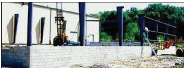
Industrial Addition, Under Construction