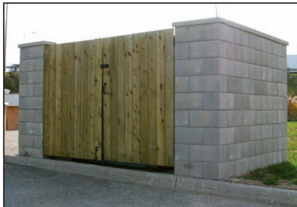
Commercial Trash Area