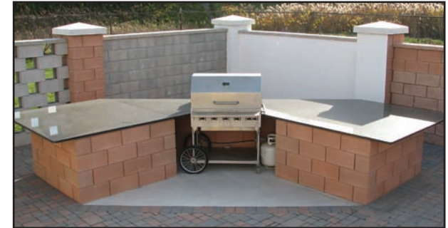
Build A BBQ / Fence