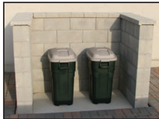
Build A Trash Area