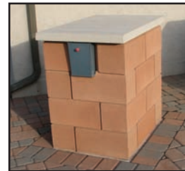
Build A Mailbox