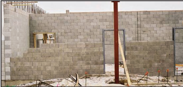
Oxford Millennium Project, Canada