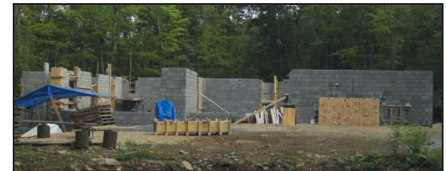
Build A New Home